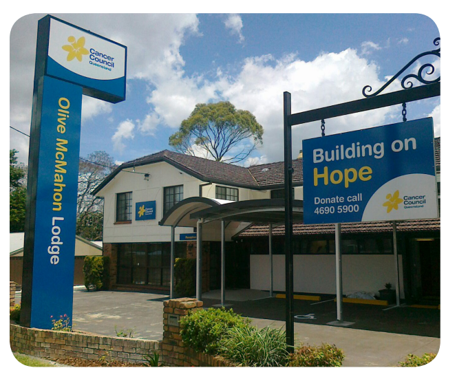
Olive McMahon Lodge

Central Queensland Cancer Support Centre (07) 4932 8600